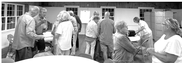
12 Teams were selected for matches which started on Friday 21 st