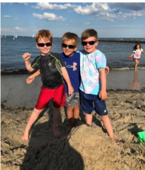
Third Place Winners: "Volcano"