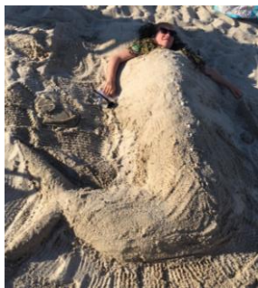
Sandcastle Contest: First Place Winner "Mermaid"