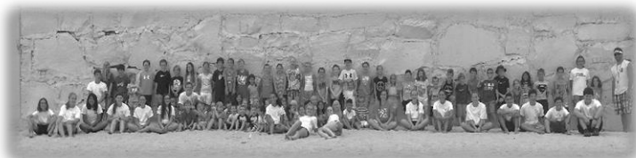
Great time at Club Olympics on the Beach on July 14 th