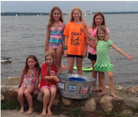
The Winning Team with the Most Crabs! They caught 75 crabs!