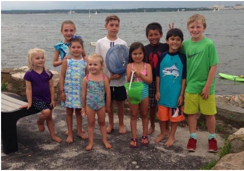
Winning Team with the Biggest Crab