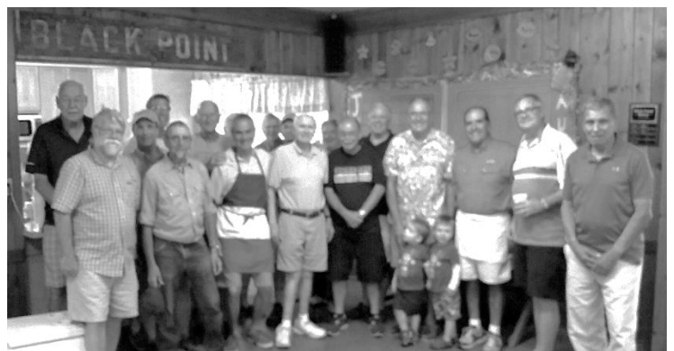
The wonderful group of volunteers to help last week at the Annual Men's Club Pasta Dinner.

~Thank you, Black Pointers, for supporting the Men's Club Annual Pasta Dinner~