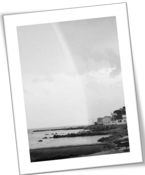
"Beautiful Rainbow over Black Point Beaches"

3 year old Grayco SnugRide 35 infant car seat base. Fits SnugRide 35, SnugRide 32 and infant SafeSeat car seats. Please call 508 728-3168