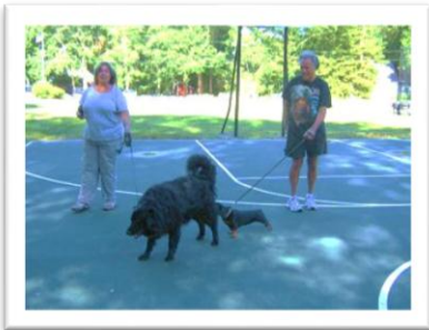
Large & small greeting (Dante & Rowena)

In addition, specific behavioral problems like aggression toward strange dogs or fear of large dogs. All in all it's a fun group making great progress. We hope to hold an AKC Canine Good Citizen test for those who are ready sometime after the final class. Date and time TBD. Members of the class as well as others are welcome to participate.