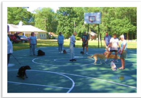
A good working group in progress